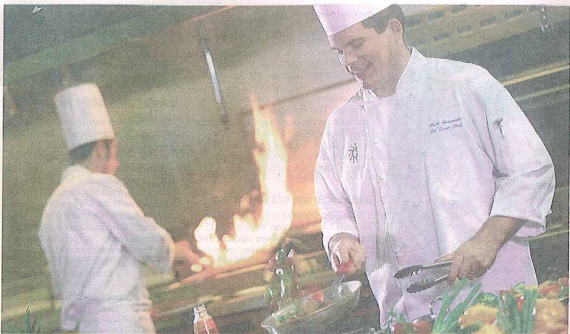
Gaylord Opryland Resort & Convention Center has added Saturday cooking classes, featuring different chefs and cuisines from resort restaurants, to its SummerFest celebration. Tickets for the Cooking Under Glass series are on sale now.