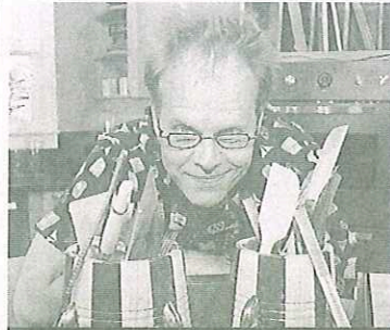
Food Network celebrity chef Alton Brown will present "Good Eats and Good Times" at the hotel Aug. 18.

Celebrity chefs, Food Network's Alton Brown and Bobby Flay, will make appearances at Gaylord Opryland over the summer. Dubbed "Good Eats and Good Times" after Brown's successful Food Network show Good Eats , Brown's 90-minute semi-