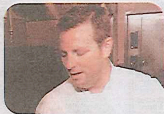
GAYLORD OPRYLAND RESORT

"All of them just represent comfort for me," he said. "I know that I'm going to be satisfied and fill a hankering, if you will."