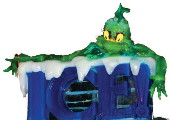
Exhibit melts hearts