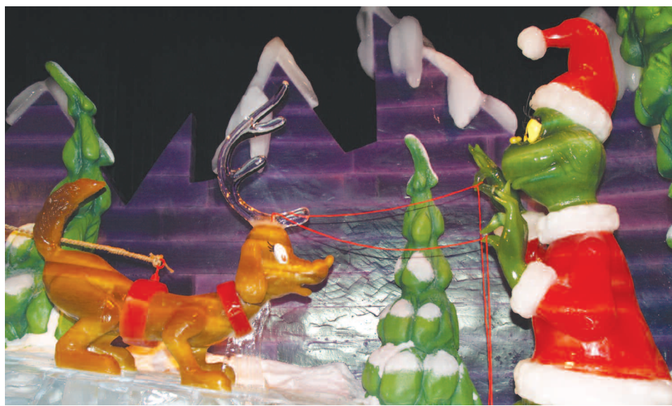
exhibit at the Gaylord Opryland Resort and Convention Center.

For the second and final year, many of the "Grinchy" scenes from the book have been brought to life in Ice!, a colorful ice sculpture