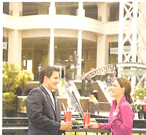
Gaylord Opryland's Paisano's (left) and Stax exterior