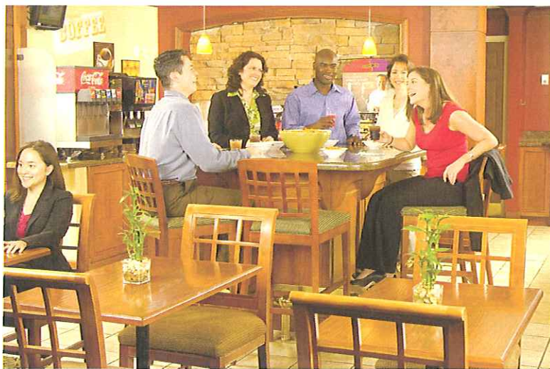
Community tables are the centerpiece of Staybridge Suites' redesigned public areas.