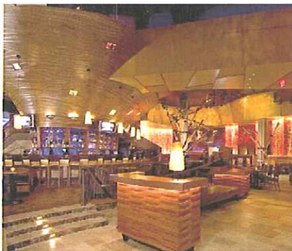
Birches Bar & Grill, Mohegan Sun