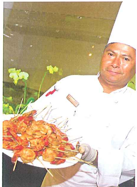
Westin Opening Celebration