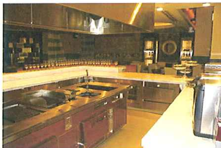
Chef's Table, Seminole Hard Rock Hotel & Casino