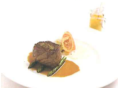
Willard InterContinental's winning entrée