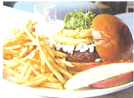
Olympic Burger, Avalon Beverly Hills